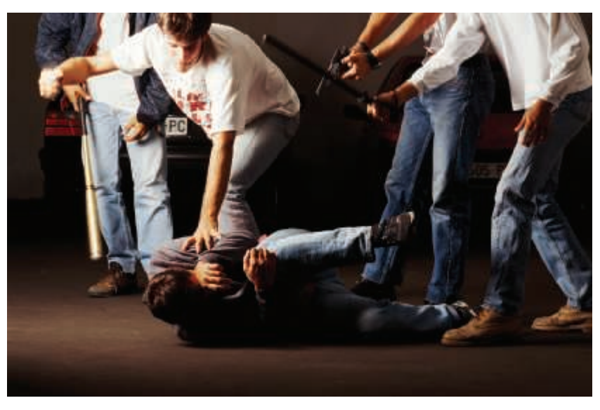
What does this photo show us about the discrepancies that exist between the democratic ideals and the social realities of our society? Does discrimination against subordinate group members take place in other societies as well?